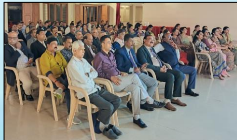
Dignitaries and Invitees who graced the occasion