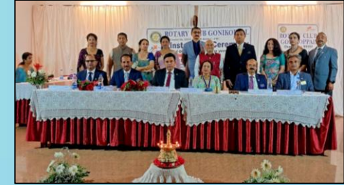
Members of our Club who represent District team