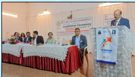
Vote of thanks by Secretary