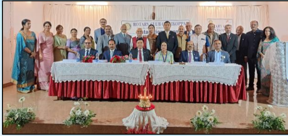
Office bearers for the year 2024-25